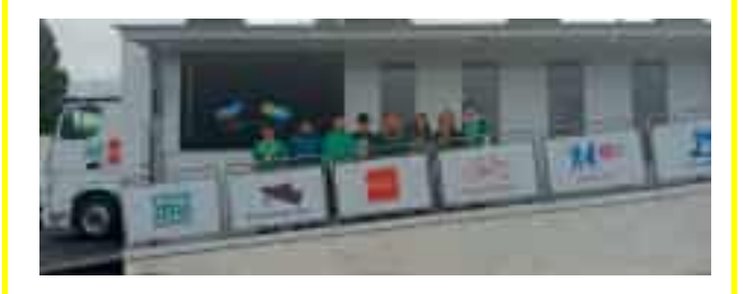
Senior Students pictured on the Road Safety Authority Shuttle Bus with their teacher, Ms. Y Ryan.

We had a very educational and thought provoking day with the Road Safety Authority recently. The roadshow brought road safety education to life in an engaging, interactive and memorable way. Students were able to practice their driving and hazard perception skills on the car, motorbike and bicycle simulators. They experienced, first-hand, the dangers of driving and texting as well as driver fatigue. They were able to try the brake reaction timer to see how driving environments and speed affect braking distances. They also learned about tyre safety and realised that tyres are their only contact with the road. It was a hard hitting and realistic road safety presentation, highlighting the devastating effects that road traffic collisions have on people's lives.