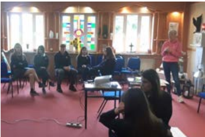
5 th year students attending the training day for the Big Brother Big Sister mentoring programme

Many thanks to all the students and teachers who volunteered to be part of the BBBS team.