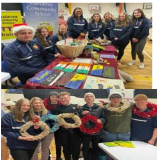
TY Students enjoying the Craft Fair in the Hub recently.