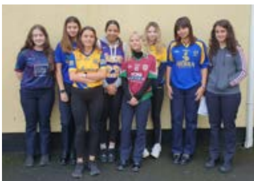
Students sporting their favourite jerseys while raising funds for Goal.