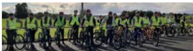
TY students ready for take-off on their cycle

Class 4A participated in cycling with Cyclist, Daire Feeley and Paralympian Cyclist, Richael Timothy. They learned the proper signals to use while cycling and how to be safe on the main road during a cycle. They also cycled a 10 kilometer route around Castlerea, to practice their newly acquired skills.