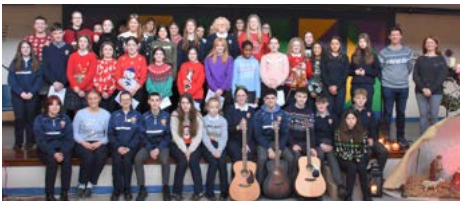
Pictured above are the students and teachers who participated in the school's annual Carol Service.

Well done to all those involved in the recent Christmas Carol Service. It was a most uplifting and enjoyable occasion.