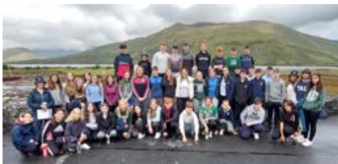
TY students on their bonding trip to Delphi, Co. Mayo