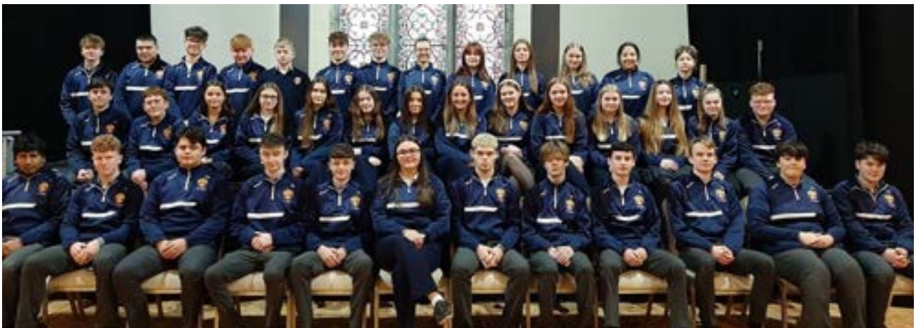
TY Students who attended the Fofoige Leadership for Life Programme in the Trinity Arts

The programme develops the leadership capabilities inherent in every young person, giving them an opportunity to harness their skills and attributes, in a fun and encouraging environment, thus helping them to contribute to their society.